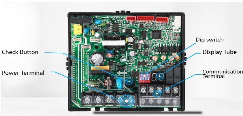
Outdoor Unit DIP Switch Location On Circuit Board